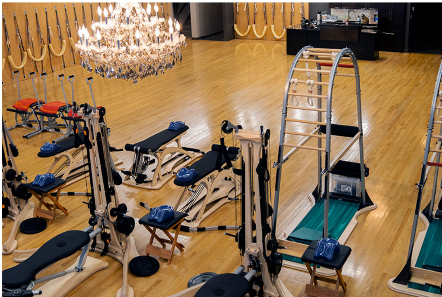
Above, the interior of Sunflower Gyrotonic in downtown Mission.